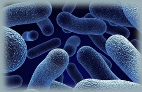
Ideonella sakaiensis 201-F6